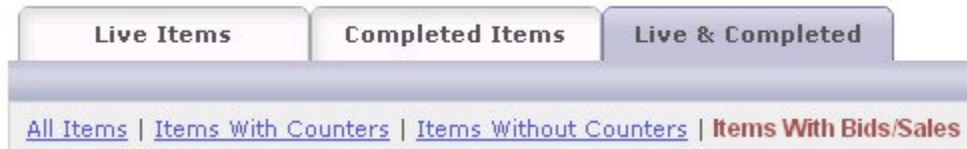
FIGURE III. Live & Complete Items Tab