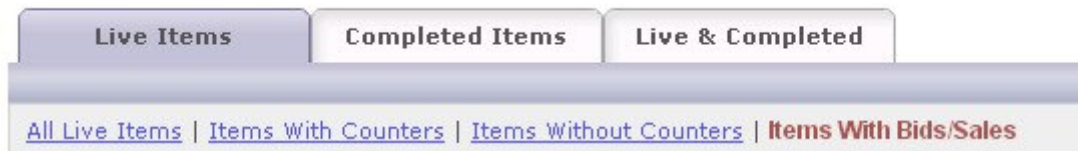
FIGURE II. Live Items Tab