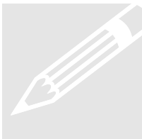
FIGURE V. Items I'm Selling View

Tip: Do not select the ADD COUNTER link if you have added a counter when listing your item. The ADD COUNTER will display until activity is triggered by a view to your counter. Once your counter is viewed, ADD COUNTER will disappear and be replaced with your item views.